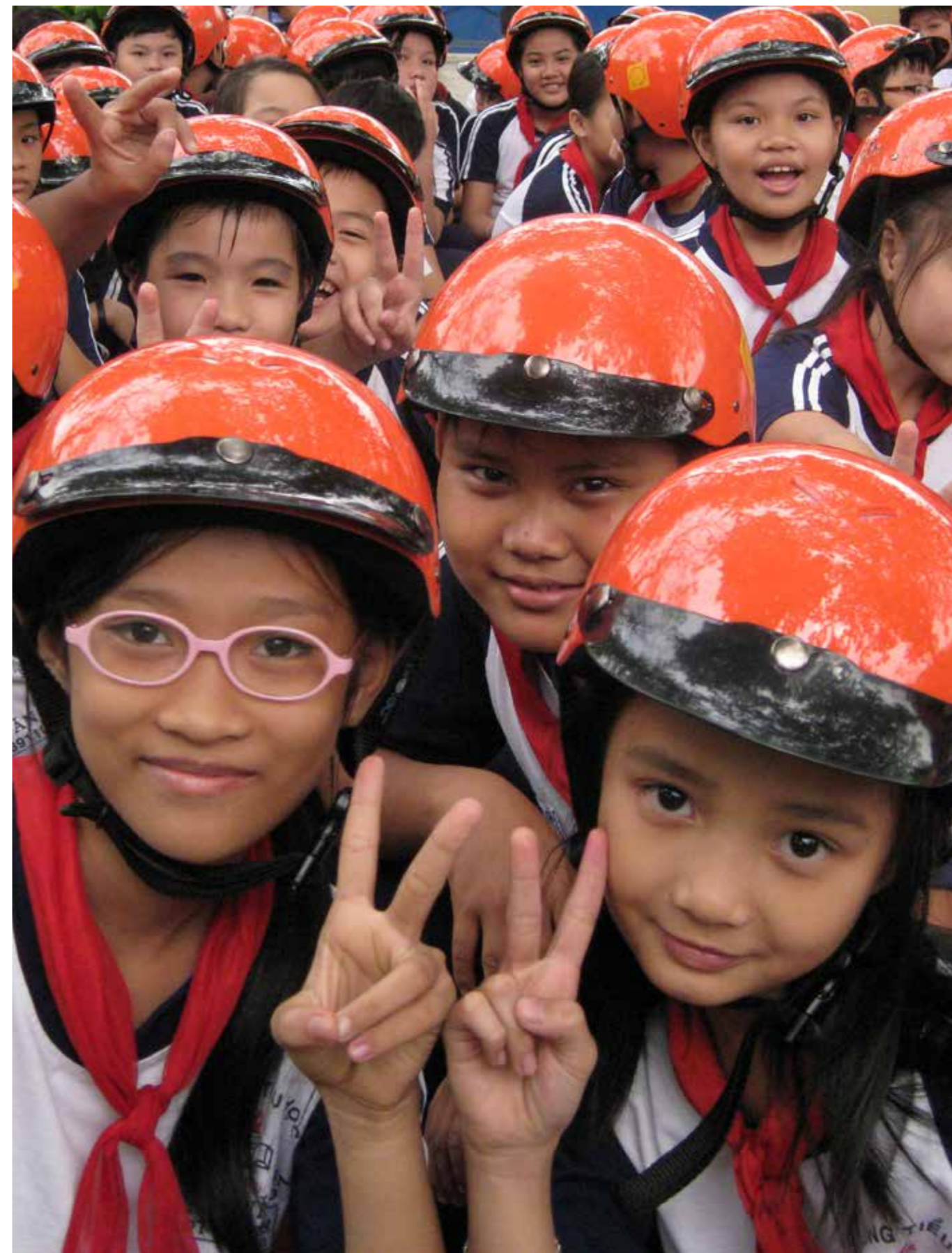
AIP Foundation's 'Helmets for Kids' is a highly successful NGO / corporate partnership for road safety