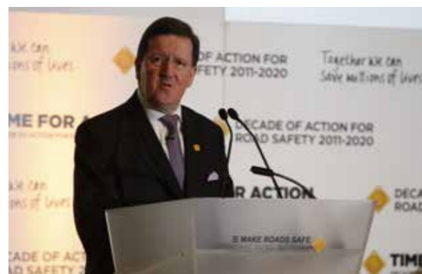
Lord Robertson, Chairman of the Commission for Global Road Safety

In 2006 the Commission for Global Road Safety recommended that a minimum of US$30million of annual funding was required to effectively resource a catalytic global action plan to tackle the key issues of road safety 14 . This was based upon an assessment of the current global road safety environment and recommendations provided by the WHO. Given that road traffic deaths and injuries have remained at a similar level it is reasonable to suggest this funding assessment remains relevant and particularly so if the proposed SDG targets are to be met.