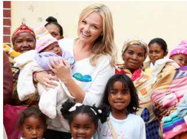
Emma Bunton supporting the Pampers/UNICEF partnership.

Established in 2006, '1 pack = 1 vaccine' is a global partnership between Pampers and UNICEF. Each time a consumer purchases a specially branded product in Western Europe, USA or Canada, Pampers will donate to UNICEF the cost of one tetanus vaccine (c. 8p) to help protect mothers and their babies in developing countries.