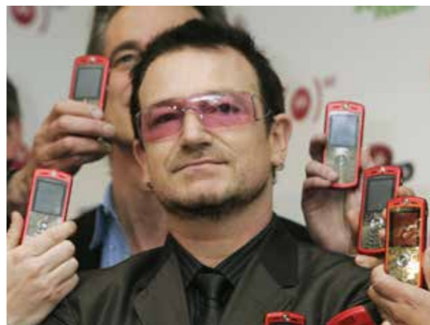
Product (RED) has raised millions for the Global Fund